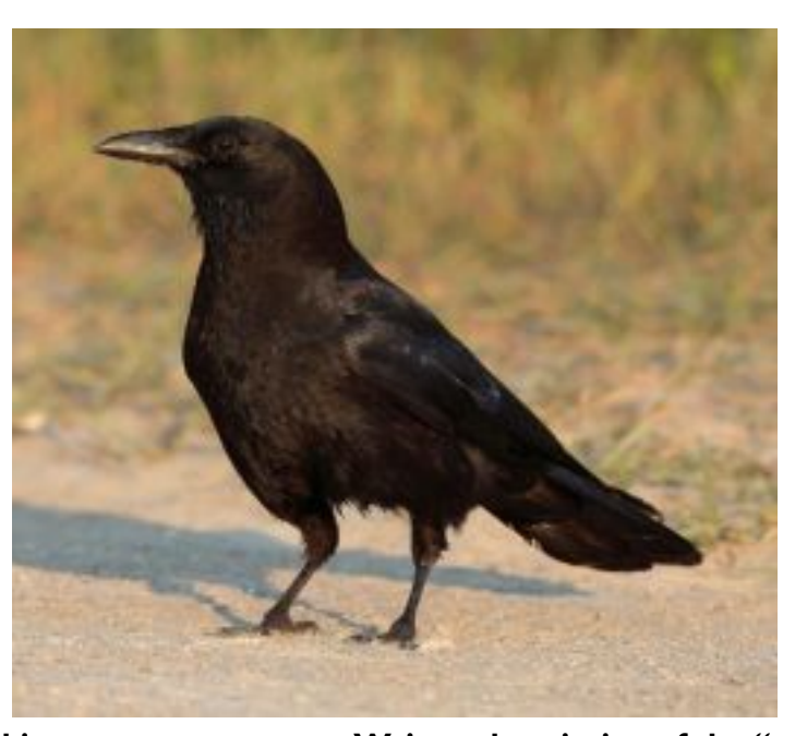
Imagine that this crow was your pet. Write a <u>description</u> of the "mixed blessing" of looking after it. You should avoid writing a whole story.